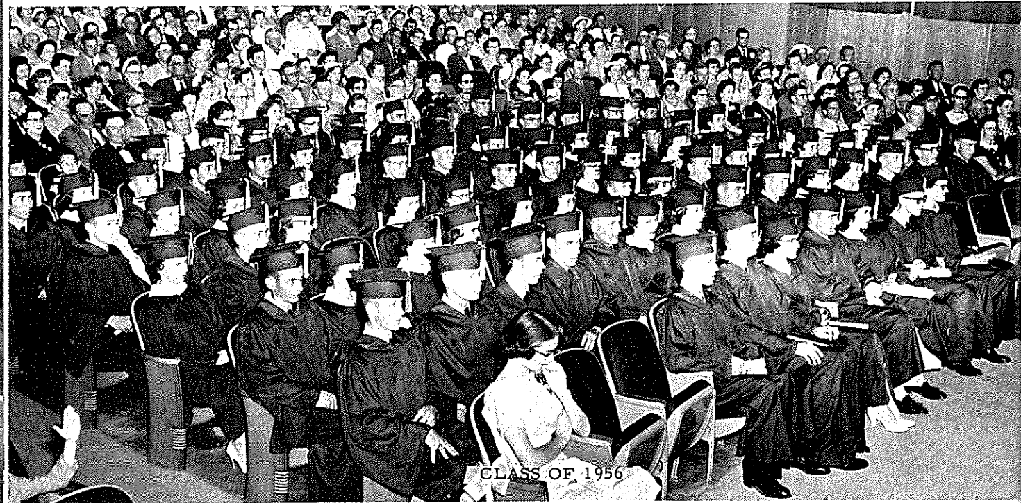
CLASS OF 1956